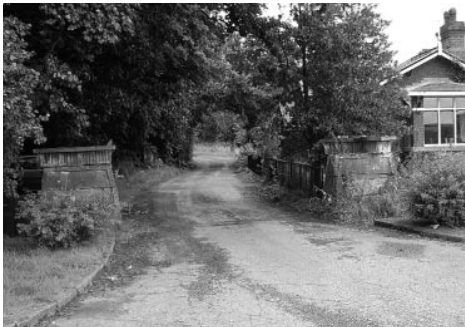
The distinctive 'Egyptian' pillars are still in place at the Chorley Lane lodge, but now looking a little worse for wear

Unfortunately, after demolition, nothing remained of this ancient seat apart from the two lodge houses, a number of outbuildings and the distinctive Egyptian Pillars at the Chorley Lane entrance. The site of the hall is now covered by a poultry house.