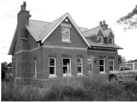
The lodge on the Common has been demolished and a new home has been built on the site.

of Huyton Bleachworks which was on the banks of the river Douglas, behind Pincroft.